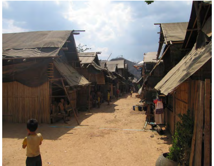
Tham Hin Camp , March 2010

2010 is a year of change for TBBC. This year we are focusing more on programmes that increase self-reliance and reduce aid dependency for the refugees by promoting and supporting additional livelihood opportunities. In July/August, TBBC will start a pilot project focusing on micro/small business development in Mae Ra Ma Luang and Tham Hin Camps. The selected applicants will participate in a five-day training on Business Development and Management. This training together with a small grant will help people start and expand micro or small businesses. As a pilot programme, this will include 400 people from Mae Ra Ma Luang Camp and 100 from Tham Hin for training, grants and other support.