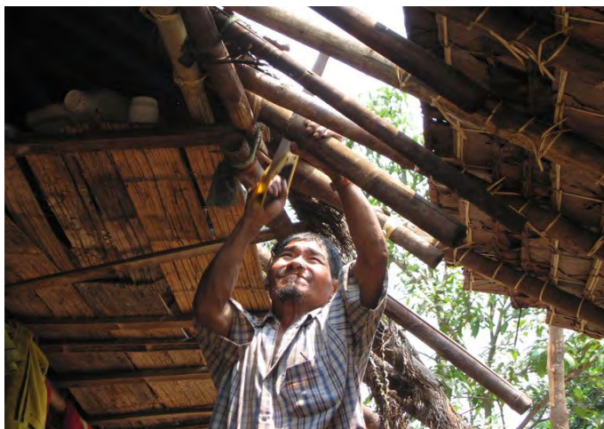
Refugee at Mae La camp fixing his home - April 2010

If this new approach proves to be successful, the needs-based approach shall be introduced border-wide in all nine refugee camps during the next shelter programme cycle.