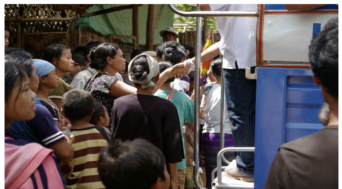
Leaving for resettlement at Site 1 ( Ban Mai Nai Soi), June 2009

Almost 60,000 people have been resettled since 2006